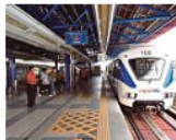
Refurbished trains project vibrant image