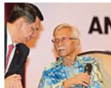
'Make the changes that people want'