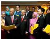
Ice-cube seller's daughter receives King's Scholarships