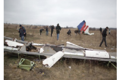
Other Aircraft Were Near MH17 When It Crashed, Says Report