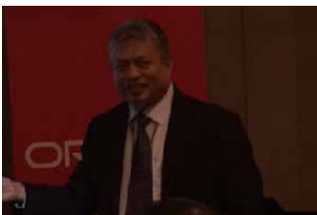
AUG 18 Oracle Security Workshop 2015, Kuala Lumpur