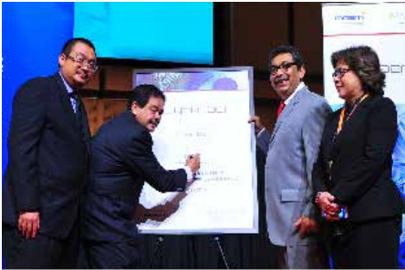
MAY 22 Launching of CyberDEF in conjunction with National Innovation Conference and Exhibition (NICE) 2015, Kuala Lumpur