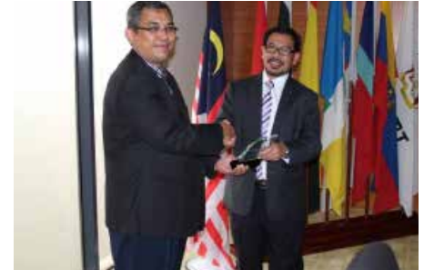
APR 6 Working Visit by the Executive Director, Market & Corporate Supervision dan Security Commissions Delegates to CyberSecurity Malaysia