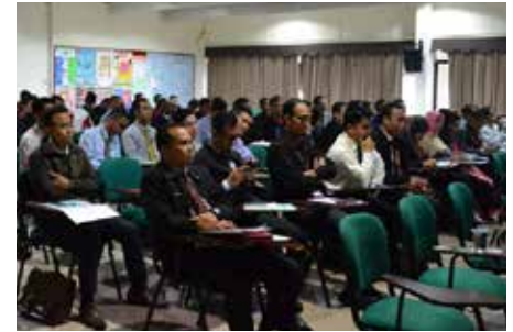
OCT 7 Management Course for Grades 27-38 Assistant Chief Security Officer of The Malaysian Government, PRIME Minister Department, Port Dickson, Negeri Sembilan.