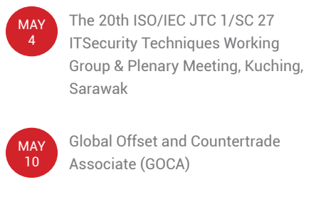
MAY 4 The 20th ISO/IEC JTC 1/SC 27 IT Security Techniques Working Group & Plenary Meeting, Kuching, Sarawak