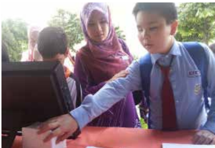
APR 16 Science 4U Carnival – Central Zone – Kiblat Walk, Putrajaya