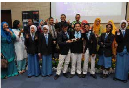
AUG 8 NICTSeD 2015 – Qualifying, Quarter and Semi Finals, Johor Bahru