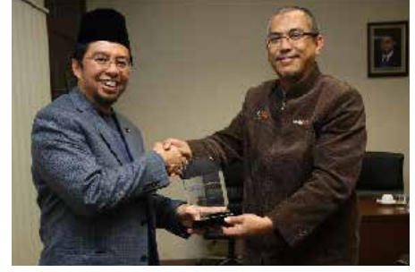
MAY 12 Strategic Collaboration between CyberSecurity Malaysia and Universiti Teknikal Malaysia Melaka (UTeM), Melaka