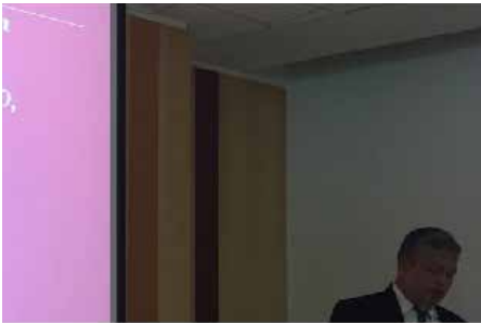
MAR 4 Cyber Security Issues Seminar