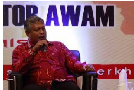
MAR 19 Public Sector Social Media Forum