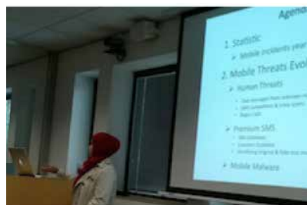
JUN 4 FIRST Technical Colloquia (TC'S) 2015, Amsterdam, Netherlands