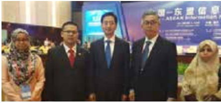
SEPT 13 China-ASEAN Information Harbor Forum, Quanzhou, China