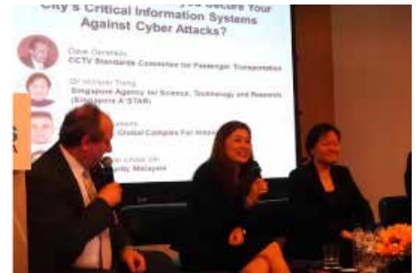
MAY 12 Safe Cities Asia 2015, Singapore