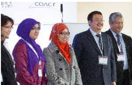
SEPT 16 Strategic Working Visit and International Common Criteria Conference, United Kingdom