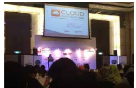
OCT 7 Could South East Asia Conferences 2015, Kuala Lumpur