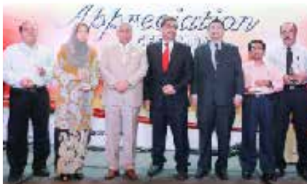
JAN 15 CyberSecurity Malaysia Appreciation Ceremony 2014