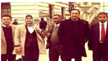
JAN 27 Second UK-Malaysian Transnational Crime Working Group Meeting and meeting with Information Security Group (ISG), Royal Holloway, University of London (RHUL)