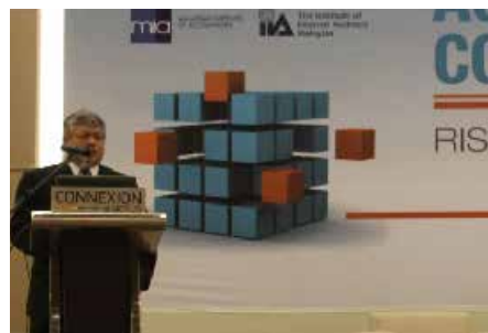
MAR 24 Audit Committee Conference