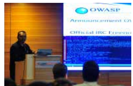
JUN 12 Meeting and Working Visit to CNCERT, Beijing, China