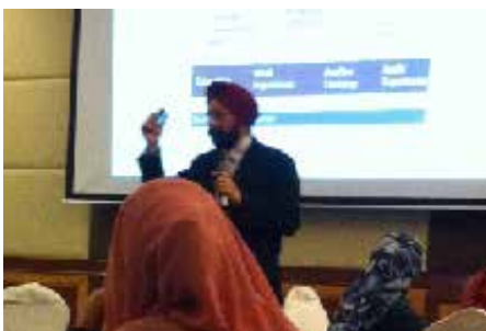
MAR 10 Internal Audit ISO / IEC 27001: 2013 course