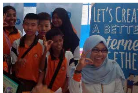
MAR 28 Activities and Exhibition in conjunction with the Majlis Graduasi & Inovasi 2015 tt SMK Ghafar Baba, Melaka