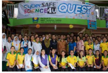
APR 29 Science 4U Carnival – Sabah Zone, Penampang