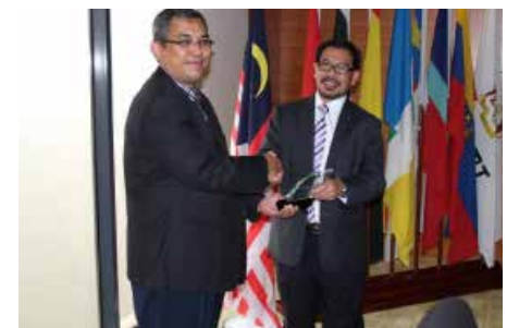
JUN 10 Signing Ceremony of the Memorandum of Understanding between CyberSecurity Malaysia and Moroccan National Defense through the General Direction of Information System Security (DGSSI), Kuala Lumpur