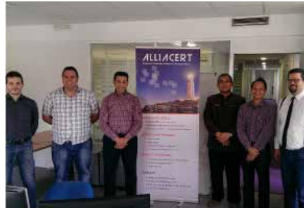
JUN 1 Strategic Working Visit to AlliaCERT, Paris, France