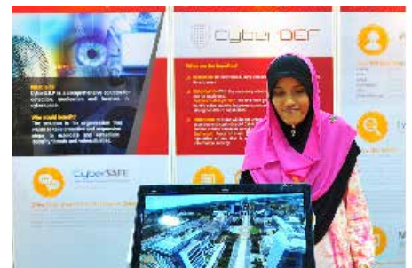
MAY 21 National Innovation Conference & Exhibition - NICE 2015, Kuala Lumpur