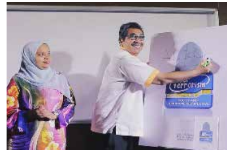
FEB 23 Safer Internet Day 2015