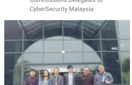
APR 14 Meeting and Working Visit to CNCERT, Beijing, China