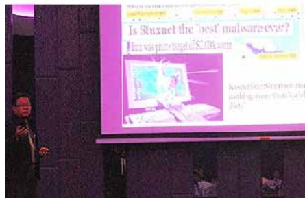
FEB 10 OpenSys Seminar 2015