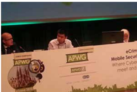
MAY 26 Cyber Security and Live Simulation Seminar, Kuala Lumpur Symposium on Electronic Crime Research (eCrime 2015), Barcelona, Spain