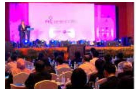
JUN 9 Asia PKI Conference 2015