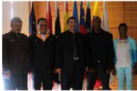
OCT 4 Working Visit by The National Commission on Research, Science, Technology (NCRST), Namibia.