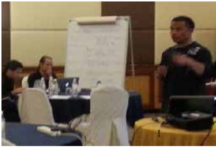
AUG 6 CyberSecurity Malaysia (CSM) Technology Roadmap Workshop & Discussion Session, Putrajaya