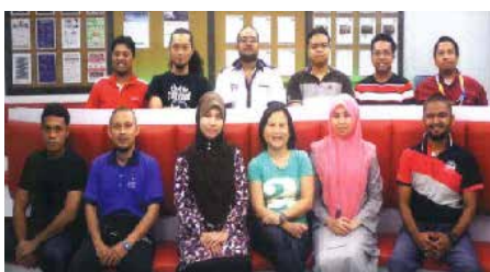
FEB 9 Certified Security Analyst (ECSA) Training