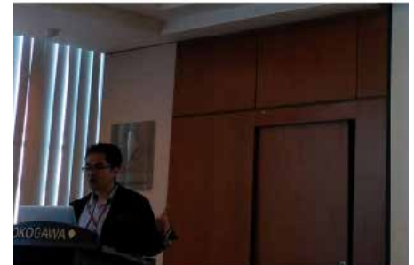
MAR 31 Cyber Security Awareness with the Industry Program