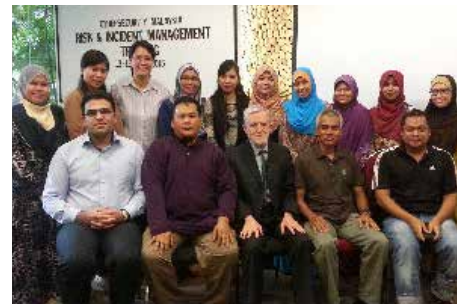
MAY 13 Applied Risk and Incident Management Seminar, Kuala Lumpur