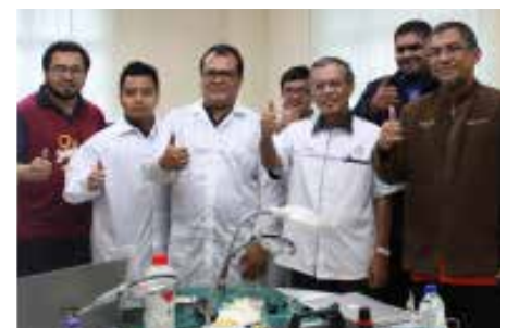
APR 2 Ops Jelajah Cyber – Zone 3, Terengganu