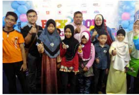
APR 25 Prize Giving Ceremony of Kuiz Celik CyberSAFE – ASUH, Kuala Lumpur