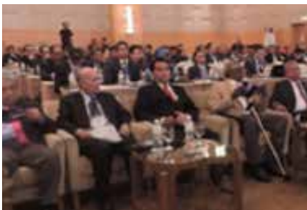
MAY 26 Cyber Security and Live Simulation Seminar, Kuala Lumpur