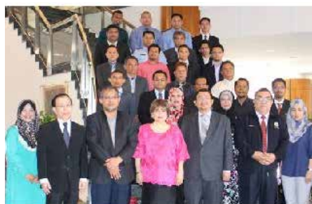
FEB 10 Cyber Security - Protection of Critical Sectors Seminar