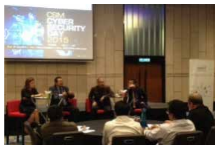
JUN 8 Cyber Security Day, Kuala Lumpur