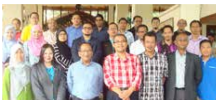
JAN 28 National Cyber Security Awareness Master Plan Workshop