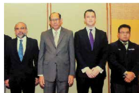
MAR 3 7th East Asia Security Outlook Seminar 2015