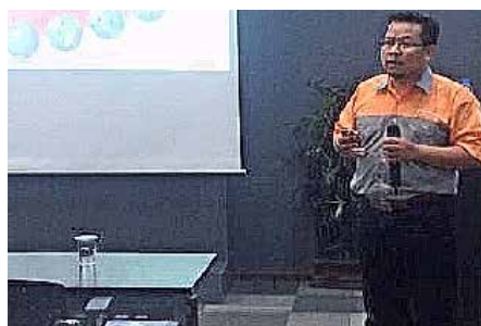
AUG 25 Enhancing Port Security Against Terrorism Course Seminar, Pulau Pinang