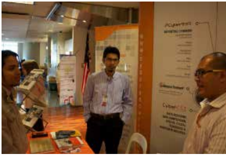
APR 16 Khazanah ICT Day Carnival 2015, Kuala Lumpur