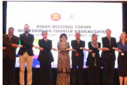
MAR 25 ASEAN Regional Forum – Workshop on Counter Radicalisation and the Internet