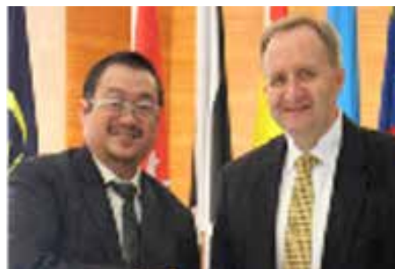
JUN 2 Visit from The Ambassador and Delegation of ICT Industry, Czech Republic