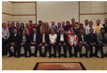
APR 29 ISMS Transition Briefing Session, Putrajaya