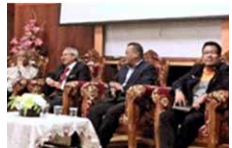
OCT 7 Cyber Awareness Seminar, Politeknik Muadzam Shah, Kuantan, Pahang.