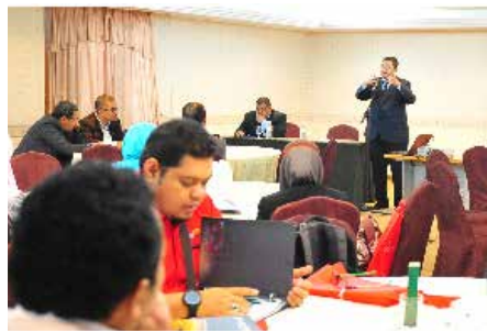
AUG 18 Cyber Security Readiness Workshop, Cyberjaya