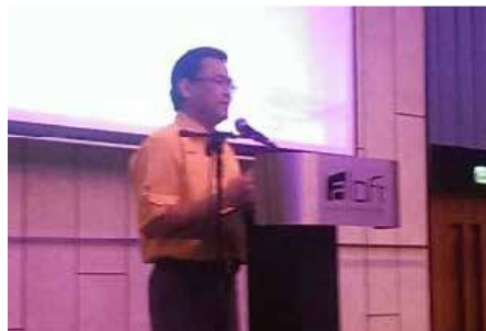
AUG 25 Briefing on the Preparation of Information Security Management System Certification (ISO/IEC 27001:2013), Kuala Lumpur