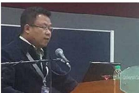
SEPT 28 4th International Industrial Security Seminar, Pulau Pinang