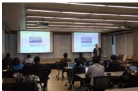
OCT 6 Workshop on Multimedia Forensics Analysis Technique and Security Health Check Day 2015, Bangkok, Thailand.