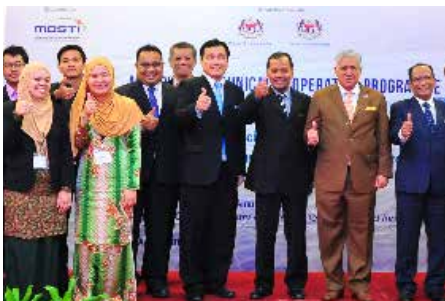
AUG 17 Cyber Security Technical Training Among ASEAN Countries, Selangor