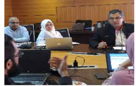
AUG 26 Development of Cyber Security Framework for the Public Sector Workshop 2016 - 2020 with Industry, Kuala Lumpur