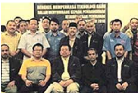
OCT 4 Workshop on Empowering New Technology in Contributing to the Development of Fisheries Engineering, Morib, Selangor