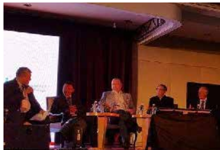
AUG 25 MyIoT Week 2015, Kuala Lumpur