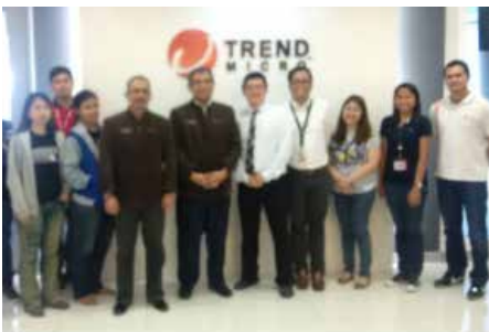
APR 22 Cyber Intelligence Asia Conference 2015, Manila, Philippines