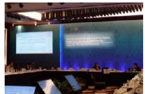
AUG 28 Asia-Pacific Economic Cooperation Electric Commerce Steering Group-Data Privacy Subgroup (APEC ECSG-DPS) & World Trustmark Alliance (WTA) Task Force Meeting, Manila, Philippines