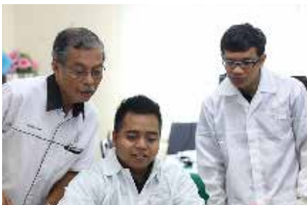
MAR 13 Ops Jelajah Cyber – Zone 1 Kelantan and Zone 2 Pahang