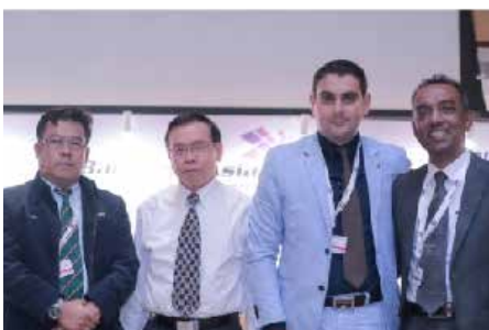
MAR 17 7th Annual Bank Tech Asia 2015