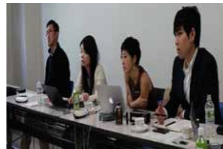
MAR 2 39th AAsia Pacific Network Information Centre (APNIC) Conference & APCERT Cyber Security Day 2015