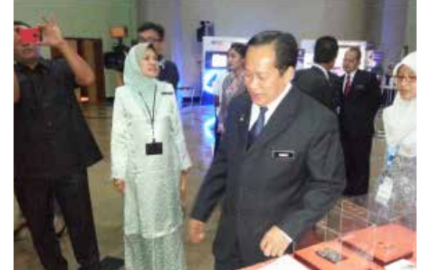
JUN 9 National ICT Seminar - MyGOV Tech 2015