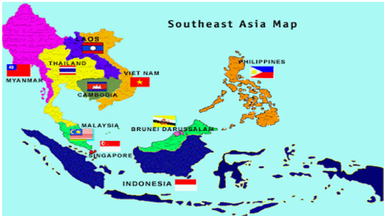
Association of South East Asian Nations (ASEAN) Map